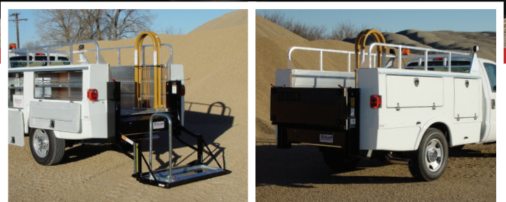
*Photos shown are the 904 Commercial Tire Service Truck.

The loadbed is a full 49.5 inches wide and features ribbed aluminum side walls and floor for added strength and durability.